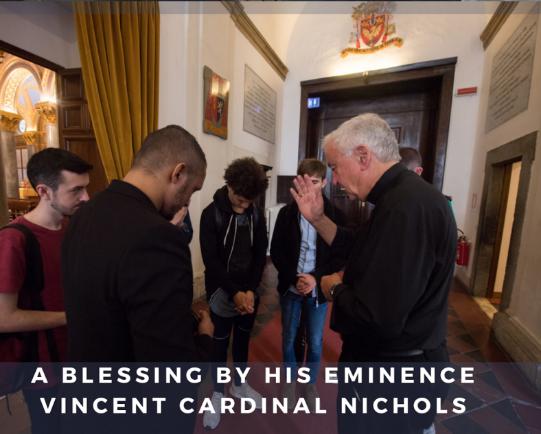
A BLESSING BY HIS EMINENCE VINCENT CARDINAL NICHOLS