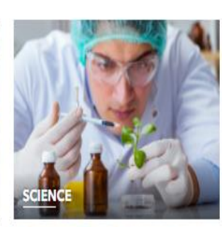
Engineering and science