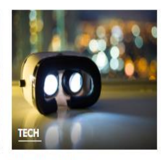
IT and technology