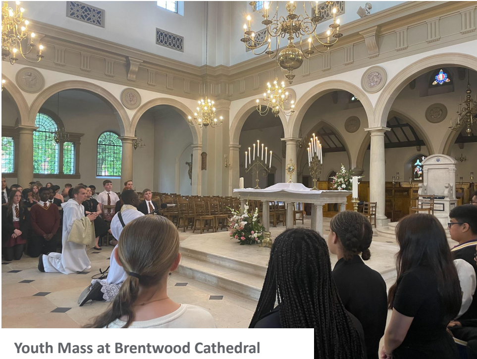
Youth Mass at Brentwood Cathedral

“The Eucharist is a fire which inflames us.”